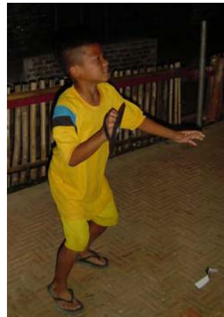
Trying out the toys