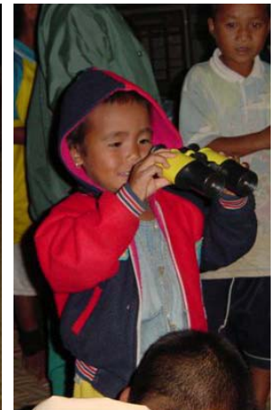
What are those for?