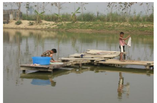
How dishes and clothes are currently being washed

children. The realisation of the water treatment system significantly raises the hygienic standard on the site and minimises the health risks associated with swimming in a contaminated pond. The rice paddies surrounding the site are treated with pesticides and many of these chemicals are washed right into the kids 'swimming pool'. Child's Dream has spent about THB 285'000 (approx. USD 7'100) to realise the water treatment system and the shower rooms.