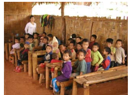
Primary school in Wan Pieang Fha

Because of the large number of children, the camp committee started running a nursery school with 85 children and four teachers and a primary school with 295 children and nine teachers. Unfortunately, due