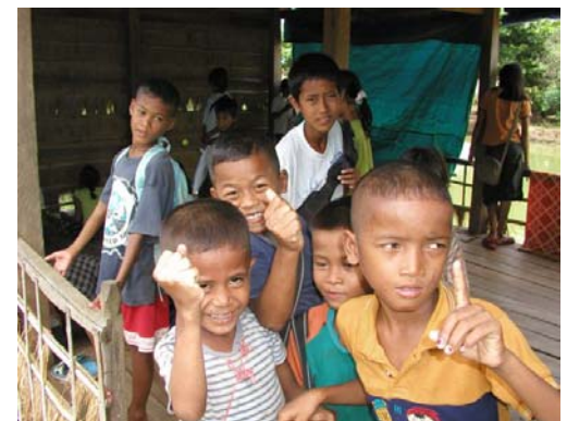
Kids at the Goutte d'Eau shelter in Poipet

wards us making their way unchecked into Thailand, which is part of their daily routine in the struggle to survive. Once we had crossed the border, we were greeted by huge 5-star casino resorts catering for ultra-rich Thai customers, often officials, we were told. Nowhere on this planet had we experienced such a gap between rich and poor, adding disgust to our moods. We met four organizations caring for children in this area to learn more about the complex factors leading to this humanitarian crisis. Children with or without families migrate to the Poipet area from their home towns in the countryside. They are attracted by the hope of making money like flies by the deadly blue light of a fly trap. Once in Poipet, the risk of exploitation is enormous. Organized trafficking gangs sell girls and young women into prostitution and boys into begging rings, both bound for Bangkok. In addition, many children are working in the border markets and are therefore unable to attend school. We established a particular good relationship with a Swiss organization called Goutte d'Eau, which runs a couple of programs caring for about 500 children. Together, we are exploring opportunities about how Child's Dream could possibly engage and provide relief to this hot-spot.