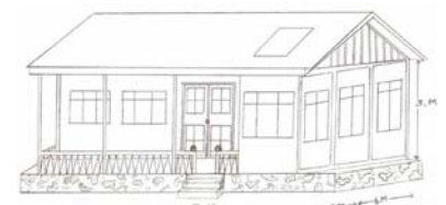
Sketch of the orphanage