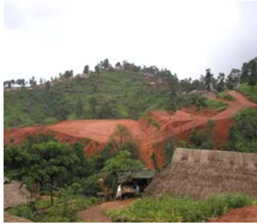
The land has already been prepared

SWAN (Shan Women Action Network), which takes care of over 1,100 children in 11 schools along the Thai – Burmese border, will be responsible for the management of this new school complex including providing the running costs.